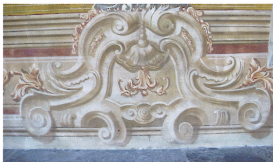
(top) Studio installation of digital prints. (bottom left + right) Source images from Italy