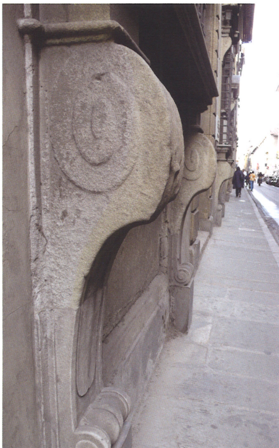
Street view, Florence