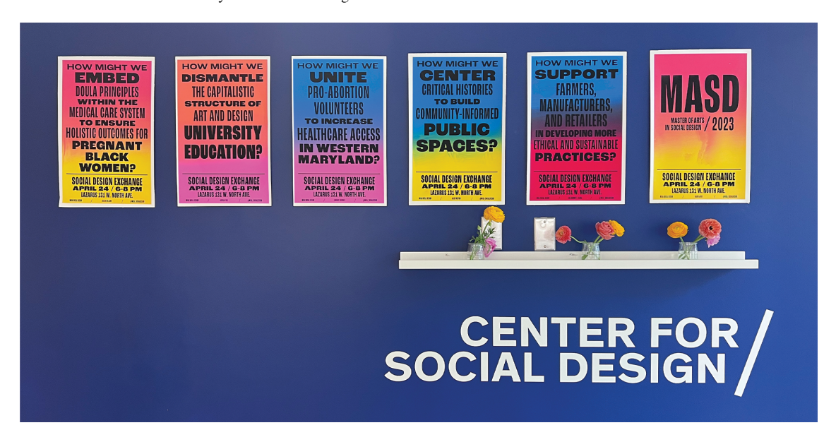
Screen Printed Posters for Social Design, MA's 2023 Social Design Exchange or SDX

Social Design, MA or MASD (maz-dee) students develop their capstone projects around a design question in a problem space of their choice and then present their findings to an audience during the spring Grad Show season. These research questions were screen printed by the students themselves and used for their culminating thesis event, the Social Design Exchange. Each question highlights the specific community or issue that was being studied by each student.