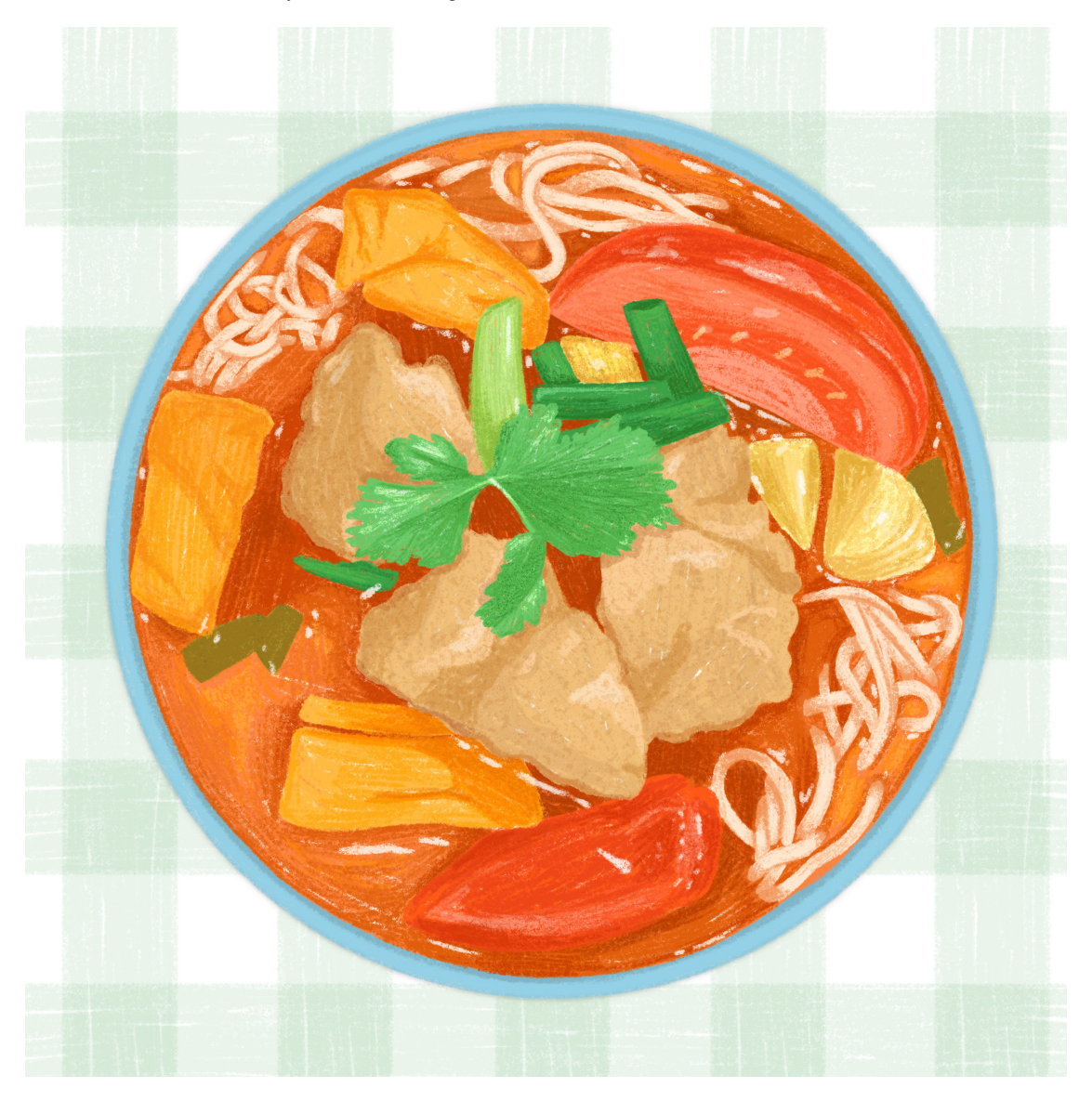
Hana Azim '23, MFA (Illustration Practice)