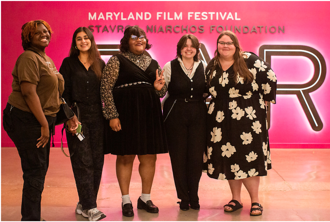
Filmmaking MFA students present their thesis projects, Spring 2023.